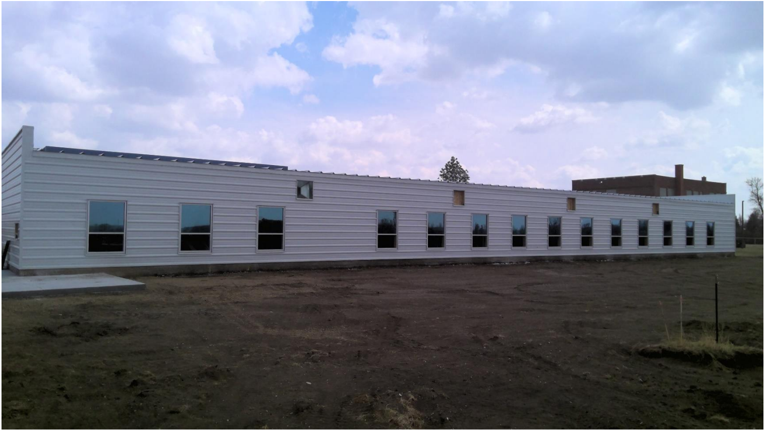
All windows installed.