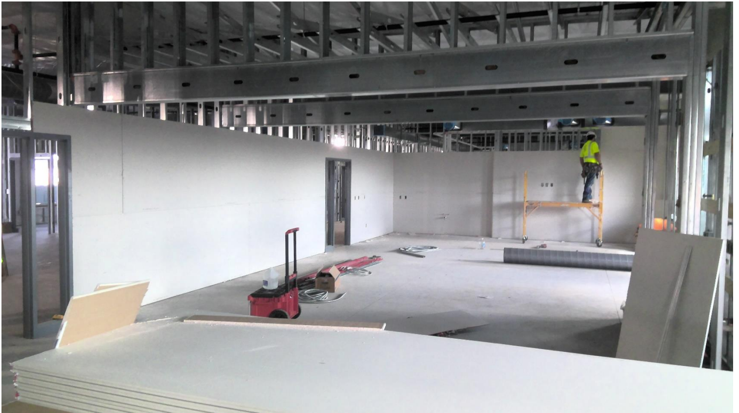
Started hanging sheet rock in the classrooms.