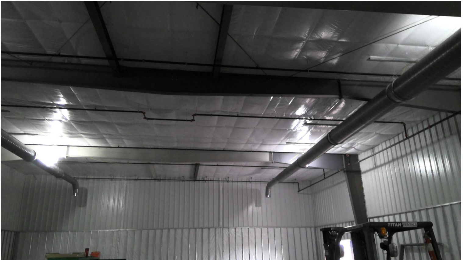
Sprinkler pipes and ductwork installed in the gymnasium.